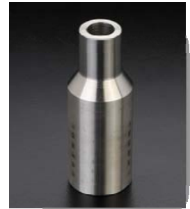
Dimensions of swage nipples (BS 3799:1974)